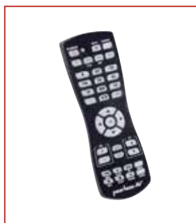
Waterproof Universal Remote

Provides exceptional picture quality from any angle