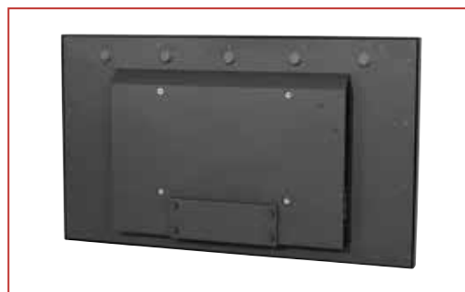
Sealed cable entry helps prevent water and debris from getting inside