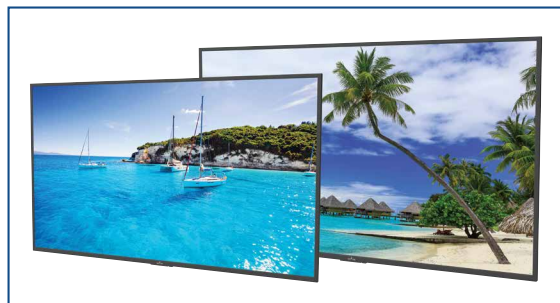
Compatible with Neptune™ Outdoor TVs