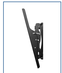
IncreLok™ Tilt Technology