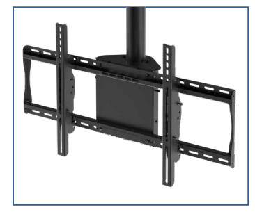
Compatible with Outdoor Tilting TV Wall Mount (EPT650) to Accommodate VESA® Patterns up to 600 x 400mm